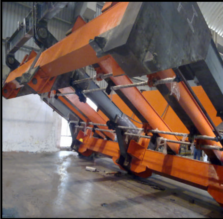
In House Development Of 5 Limb Rocker